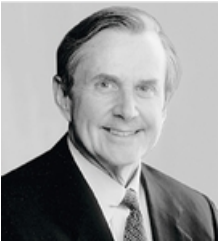
JAMES D. ROBINSON III

Mr. Nunn is Co-Chairman and Chief Executive Officer of the Nuclear Threat Initiative, a position he has held since 2001. The Nuclear Threat Initiative is a charitable organization working to reduce the global threats from nuclear, biological and chemical weapons. He served as a member of the United States Senate from 1972 through 1996. He is a Director of Chevron Corporation, Dell Inc. and General Electric Company.