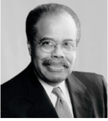
DONALD F. McHENRY