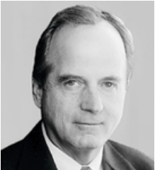
PETER V. UEBERROTH