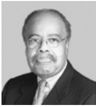
DONALD F. McHENRY