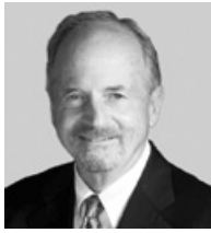
PETER V. UEBERROTH