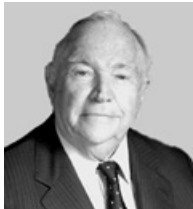
DONALD R. KEOUGH

Mr. Kent is Chairman of the Board and Chief Executive Officer of the Company. He has held the position of Chairman of the Board since April 23, 2009 and the position of Chief Executive Officer since July 1, 2008. From December 2006 through June 2008, Mr. Kent served as President and Chief Operating Officer of the Company. From January 2006 through December 2006, Mr. Kent served as President of Coca-Cola International and from May 2005 through January 2006, he was President and Chief Operating Officer of the Company's North Asia, Eurasia and Middle East Group. Mr. Kent originally joined the Company in 1978 and held a variety of marketing and operations roles until 1995, when he became Managing Director of Coca-Cola Amatil Limited-Europe. From 1999 until his return to the Company in May 2005, he served as President and Chief Executive Officer of the Efes Beverage Group, the majority shareholder of Turkish bottler Coca-Cola İçecek A.S. Other than the Company, he has not held any other public company directorships during the past five years.