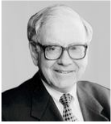
WARREN E. BUFFETT