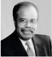
DONALD F. McHENRY