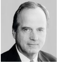
PETER V. UEBERROTH