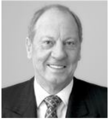
E. NEVILLE ISDELL

Mr. Diller is Chairman of the Board and Chief Executive Officer of IAC/InterActiveCorp, an interactive commerce company. He is also Chairman and Senior Executive of Expedia, Inc., an online travel company. He has held his position with IAC/InterActiveCorp or its predecessors since August 1995. He was Chairman of the Board and Chief Executive Officer of QVC, Inc. from December 1992 through December 1994. From 1984 to 1992, Mr. Diller served as the Chairman of the Board and Chief Executive Officer of Fox, Inc. Prior to joining Fox, Inc., Mr. Diller served for ten years as Chairman of the Board and Chief Executive Officer of Paramount Pictures Corporation. He is a Director of The Washington Post Company.