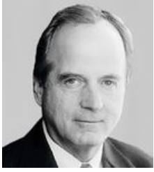
PETER V. UEBERROTH