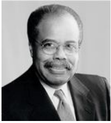
DONALD F. McHENRY