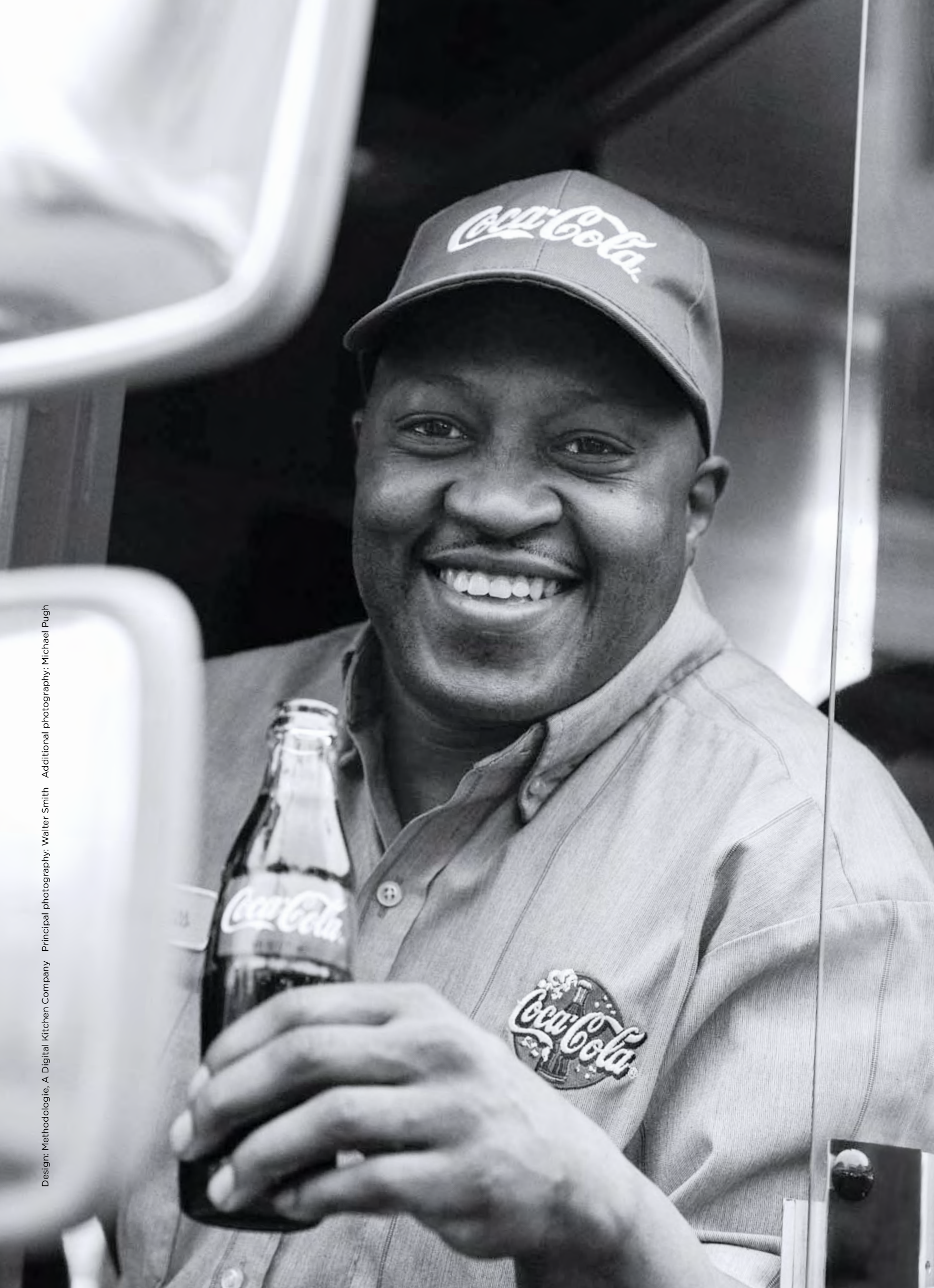
Design: Methodologie, A Digital Kitchen Company