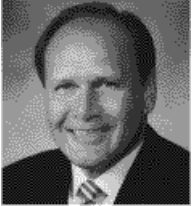
ROBERT L. NARDELLI

Mr. Diller is Chairman of the Board and Chief Executive Officer of USA Interactive (or its predecessors), an interactive commerce company, a position he has held since August 1995. He was Chairman of the Board and Chief Executive Officer of QVC, Inc. from December 1992 through December 1994. From 1984 to 1992, Mr. Diller served as the Chairman of the Board and Chief Executive Officer of Fox, Inc. Prior to joining Fox, Inc., Mr. Diller served for ten years as Chairman of the Board and Chief Executive Officer of Paramount Pictures Corporation. He is a Director of Expedia, Inc., Hotels.com and The Washington Post Company.