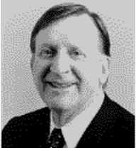
DOUGLAS N. DAFT