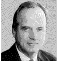
PETER V. UEBERROTH